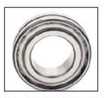
PHYMET MICROPOLY FILLED SPHERICAL BEARING