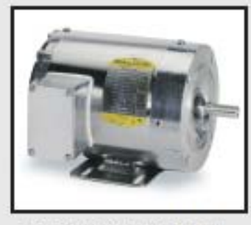
BALDOR STAINLESS STEEL MOTOR