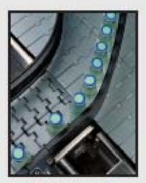
EPT CONVEYOR COMPONENTS