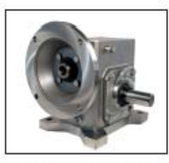
BROWNING STAINLESS STEEL RAIDER