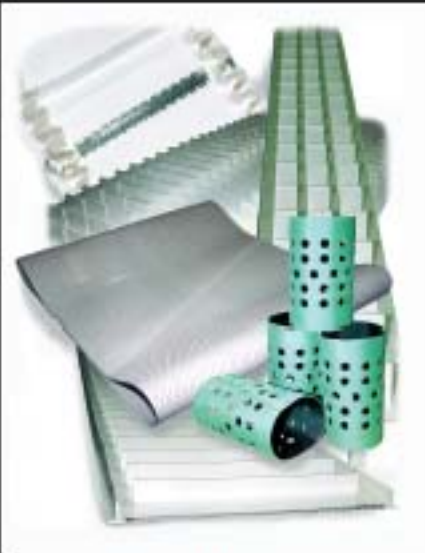
BDI BELT NETWORK